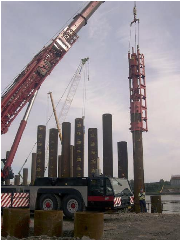
Rope suspended lead EU 62-42 with diesel pile hammer D62-22 in England